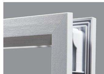
FIBERMATE WHITE Spotlights®