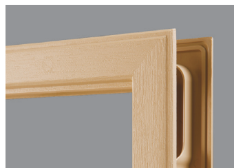
FIBERMATE OAK/MAHOGANY Craftsman