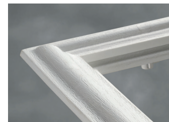
HP WHITE Evolve®