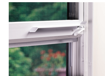
Vents* *DO NOT PAINT