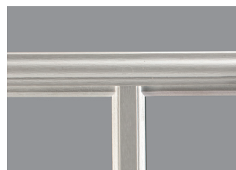
FIBERMATE WHITE/OAK Evolve® SDL