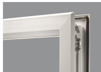
FIBERMATE PLUS WHITE ZEEL®