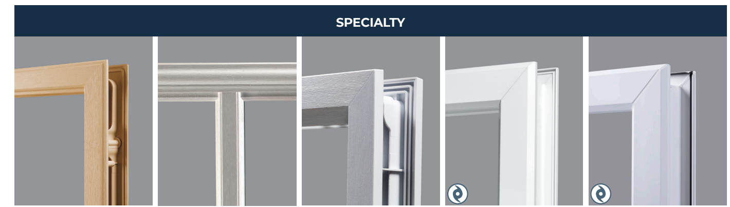
Craftsman Available in White, Oak or Mahogany Evolve® SDL Available in White or Oak Spotlights® Available in White Aluminum Impact Rated Available in White Keystone Impact Rated Available in White