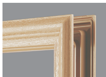
FIBERPRO OAK Standard

If you aren't sure whether your frame should be painted or stained, scan the QR code on the back of the ODL label on your doorlight. If the label has been removed, here are the frames that use these finishing instructions: