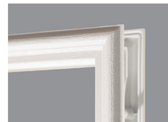
HP WHITE Standard

If you aren't sure whether your frame is maintenance-free, scan the QR code on the back of the ODL label on your doorlight. If the label has been removed, here are the frames that use these finishing instructions: