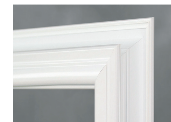
AVAILABLE IN WHITE PVC