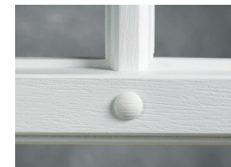
HP WHITE Craftsman