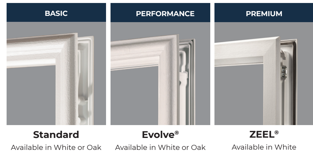
Standard Available in White or Oak Evolve® Available in White or Oak ZEEL® Available in White

We offer the widest array of doorglass frame styles, colors, and materials in the industry to meet specific needs.