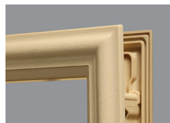
FIBERPRO OAK Evolve®