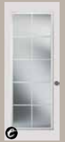
628/627/ 623-CL 10-light