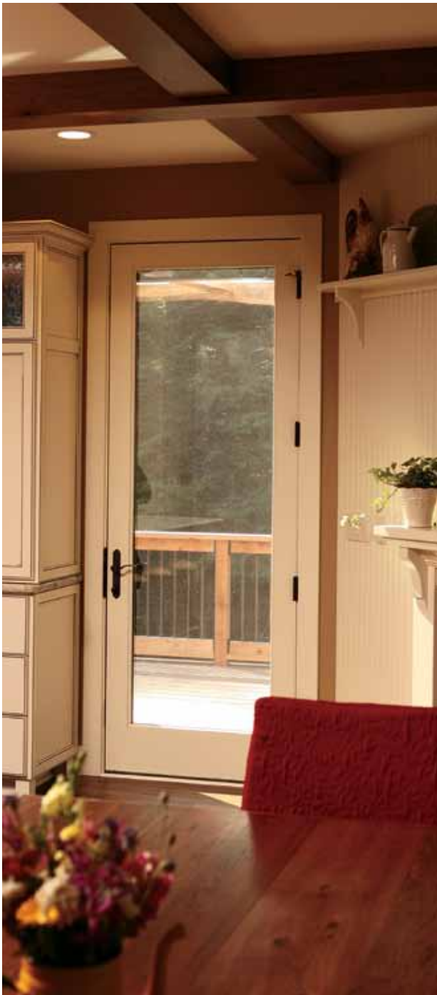
CLEAR: Doorlight 612-CL