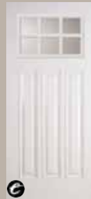
818/ NEW 868-CL*