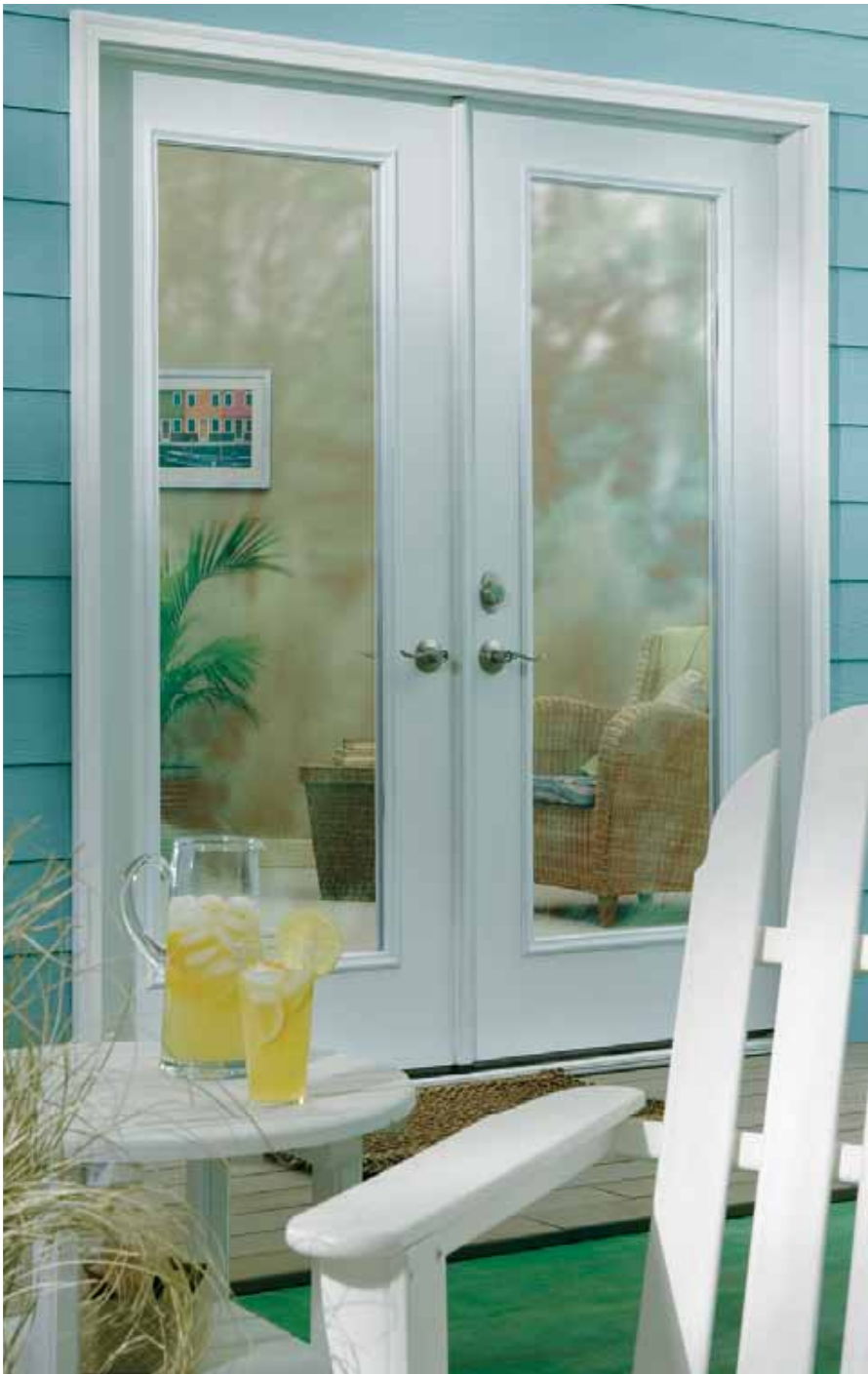
CLEAR: Doorlight 686-CL Patio Door