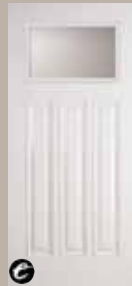
814/ NEW 866-CL*