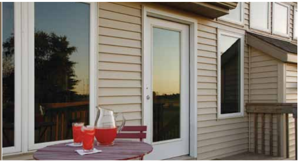
CLEAR: Doorlight 686-CL