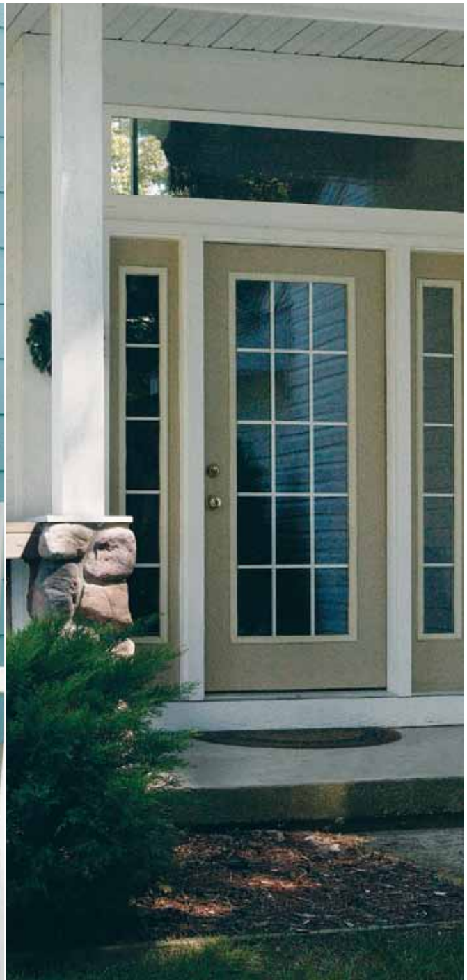
CLEAR: Doorlight 689-CL, Sidelights 695-CL, Transom 507-CL